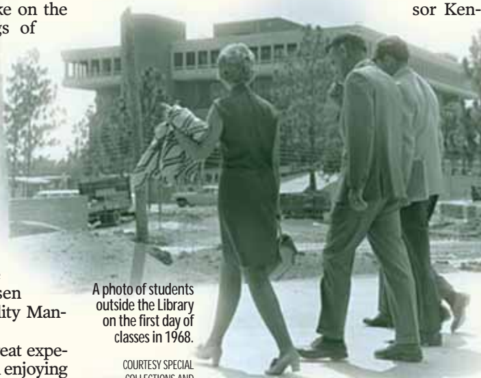
A photo of students outside the Library on the first day of classes in 1968.

Photos from UCF's first day in 1968.