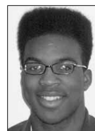
BEN BADIO Contributing Writer

law which shall abridge the privileges or immunities of citizens of the United States; nor shall any State deprive any person of life, liberty or property without due process of law; nor deny to any person within its jurisdiction the equal protection of the laws."