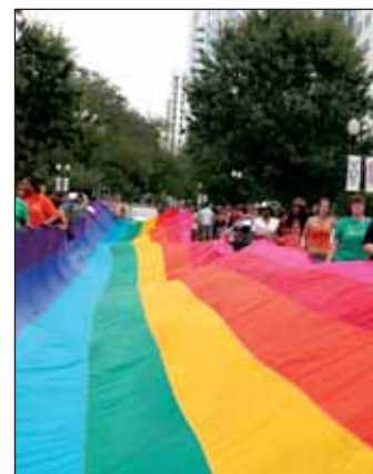
A Day Without a Gay: Call in Gay hopes for positive discourse by community service.