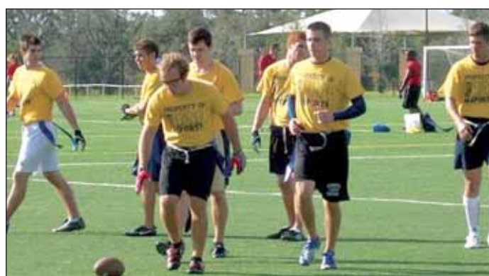
Sigma Pi, the winning fraternity for "Get in Shape the Knight Way" participates in the IM football games, in which the team's overall record was 9-1, reaching quarterfinals of Comp B.