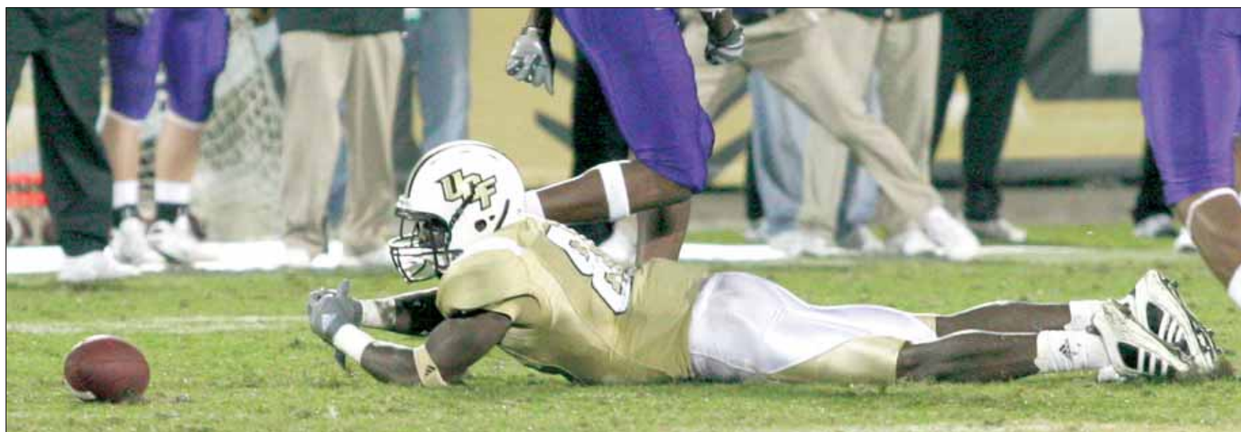
Whether it was from dropped passes, poor quarterback play or an inconsistent running game, the Knights finished the 2008 season with the lowest offensive yards per game average among the 119 FBS squads.

39,596 Average attendance of home football games